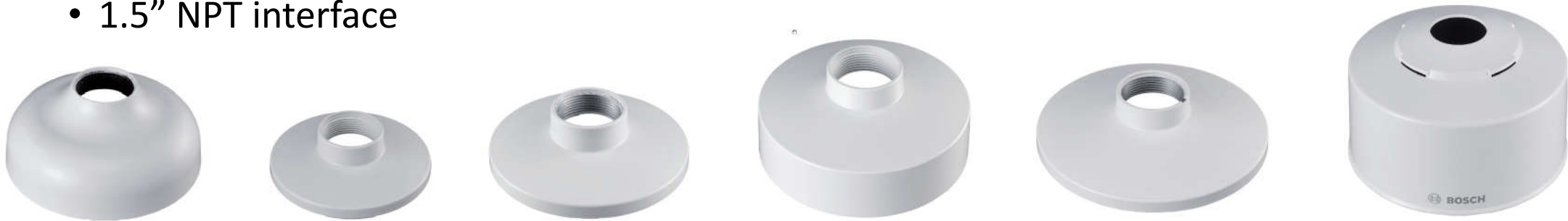
AUTODOME IP 4000(i) FLEXIDOME IP indoor 4/5000(i) FLEXIDOME IP outdoor 4/5000(i) FLEXIDOME IP panoramic 7000 FLEXIDOME IP 8000i (indoor) FLEXIDOME IP 8000i (outdoor)